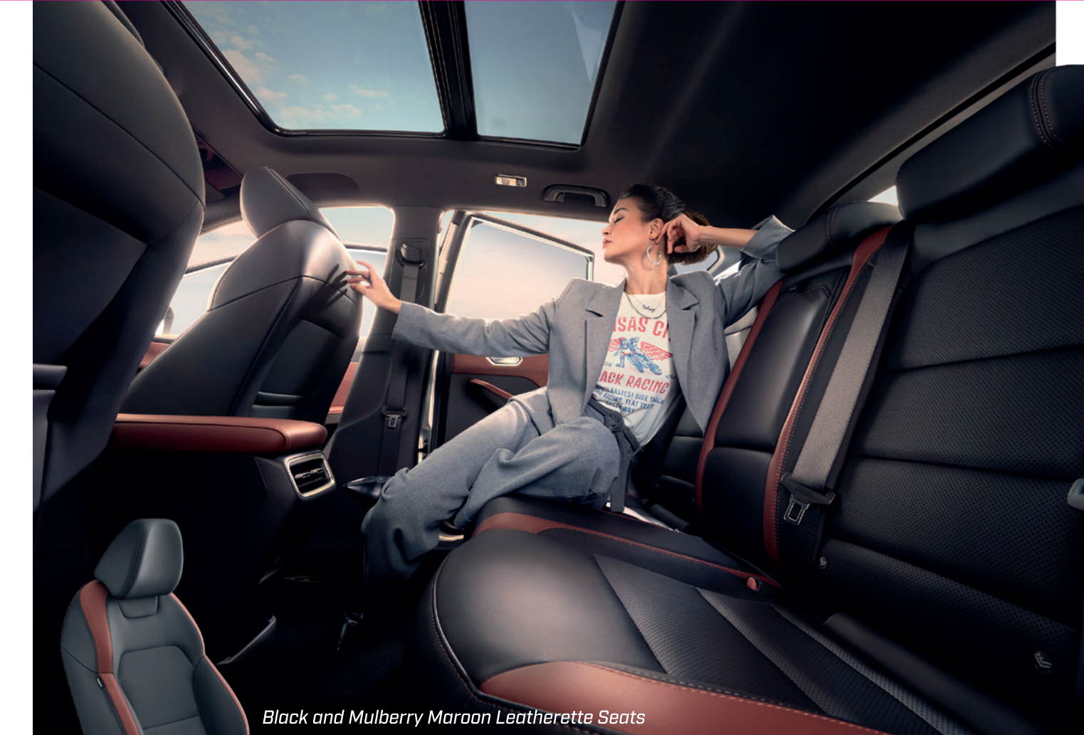
Black and Mulberry Maroon Leatherette Seats