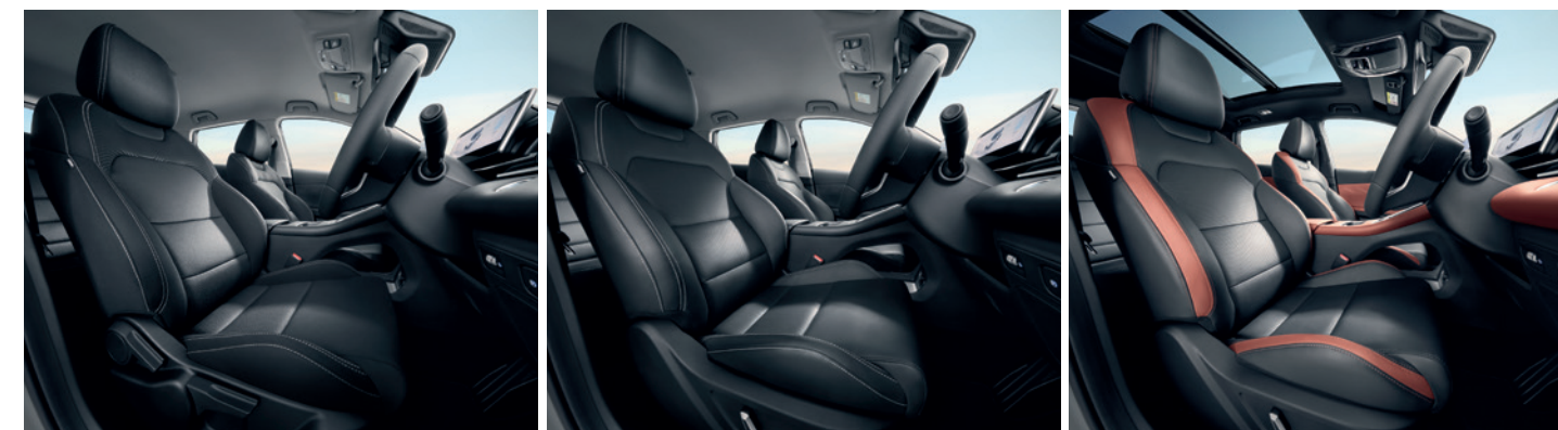
1.5TD Executive Black Fabric Seat

Designed for modern needs, the sporty SUV redefines its category with cutting edge capabilities and amazing intelligence within its compact form